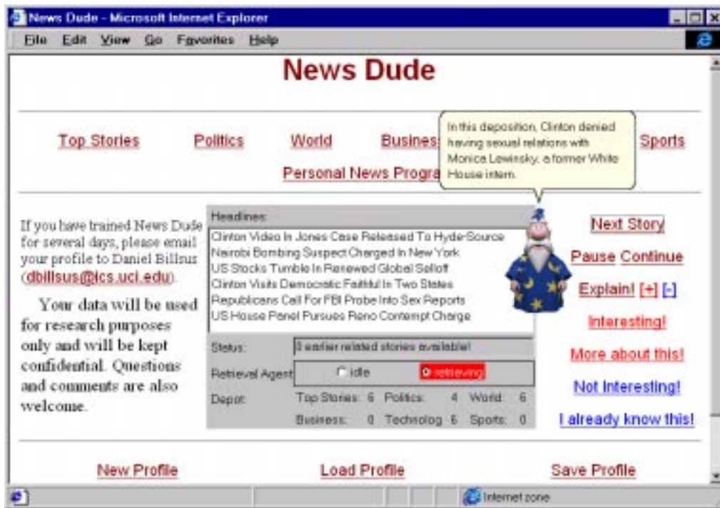
Figure 1. News Dude user interface.

Currently, the agent provides access to stories from six different news channels: Top Stories, Politics, World, Business, Technology and Sports. When the user selects a news channel, the Applet connects to a news site on the Internet ( Yahoo!News ) and starts to download stories. Since the Applet is multi-threaded, download of stories continues in the background while the synthesizer is reading, which typically allows filling a queue of stories to be read without any waiting time. The user can interrupt the synthesizer at any point and provide feedback for the story being read. One of the design goals for our system was to provide a variety of feedback options that go beyond the commonly used interesting/uninteresting rating options. If we consider an intelligent information agent to be a personal assistant that gradually learns about our interests and retrieves interesting information, it would only be natural to have more informative ways to communicate our preferences. For example, we might want to tell the agent that we already know about a certain topic, or request information related to a certain story. In summary, the system supports the following feedback options: interesting , not interesting , I already know this , and tell me more about this . After an initial training phase, the user can ask the agent to compile a personal news program. The goal of this process is to compute a sequence of news stories ordered with respect to the user's interests.